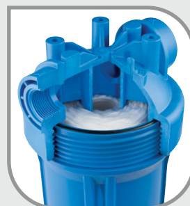
SX Cartridge with standard flat seals.